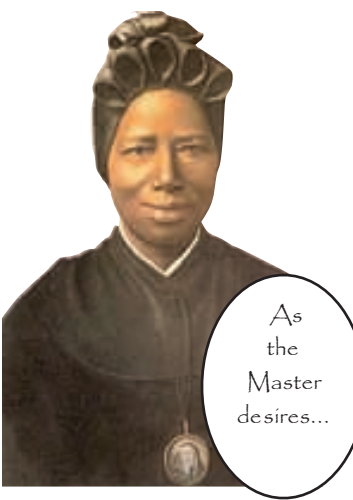
We celebrate Holy Mass at

OFFICE HOURS: Tuesday to Friday 9:00 AM to 6:00 PM